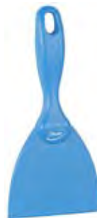
Hand Scraper, Metal & X-Ray Detectable, 100 mm

Material: Polypropylene; Metal & X-Ray detectable additive