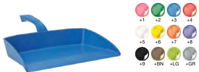
Dustpan, 330 mm

Material: Polypropylene; Polyester; Stainless Steel (AISI 304)