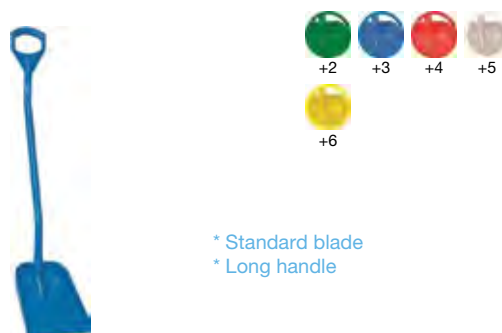
Ergonomic Shovel, 1280 mm, Standard Blade

Material: Polypropylene; Anodised Aluminium