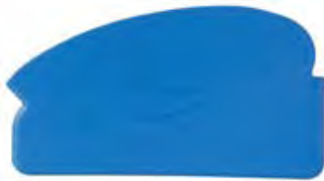
Hand Scraper, Flexible, Metal & X-Ray Detectable, 165 mm