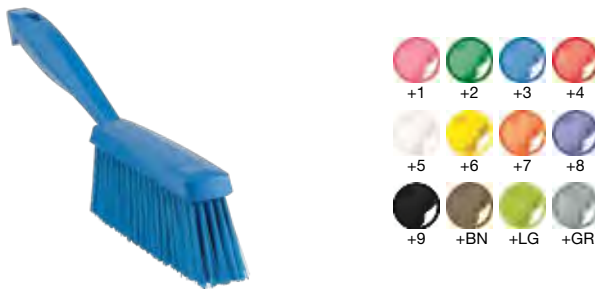
Hand Brush, 330 mm, Soft

Material: Polyethylene, Polyester, Stainless Steel