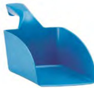
Hand Scoop, 310 mm, 0.5 Litre