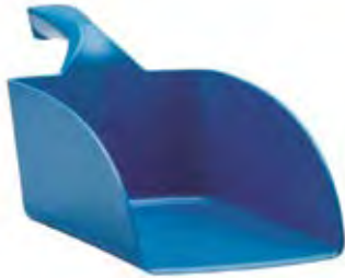
Hand Scoop, 390 mm, 2 Litre