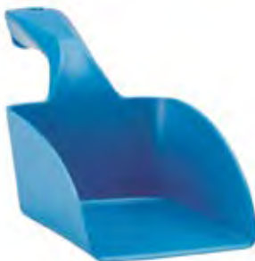
Hand Scoop, 350 mm, 1 Litre