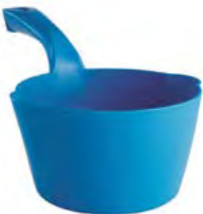
Round Bowl Scoop, 1 Litre