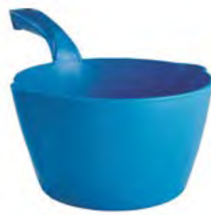
Round Bowl Scoop, 2 Litre