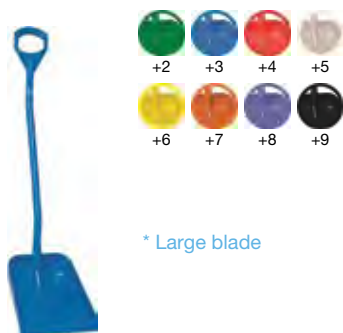
Ergonomic Shovel, 1310 mm, Large Blade