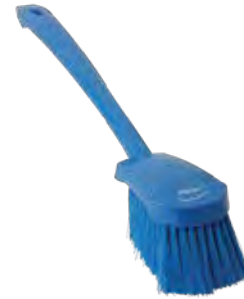
Glazing Brush w/Long Handle, 415 mm, Soft, Blue