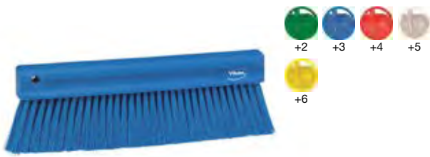
Powder/Bakers Brush, 300mm, Soft Bristle