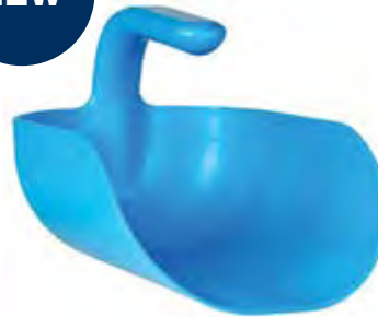
Ergonomic Scoop, 270 mm, 2 Litre