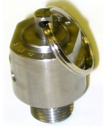
Pressure Relief valve