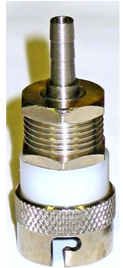
Turret Bayonet Gas Socket with 6mm Inline Hose Tail