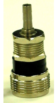
Turret Ball-Lock Liquid Socket with 6mm Inline Hose Tail.