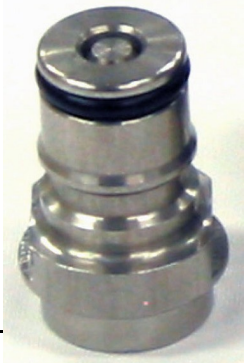
Turret Ball Lock for Liquid 9/16" UNF Thread (female)