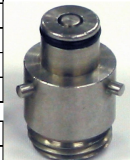
Turret Bayonet Plug for Liquid with 1/2" BSP Thread (Male)