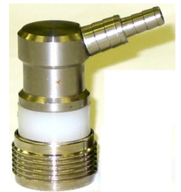
Turret Ball-Lock Gas Socket with 6mm/10mm Offset Hose Tail.